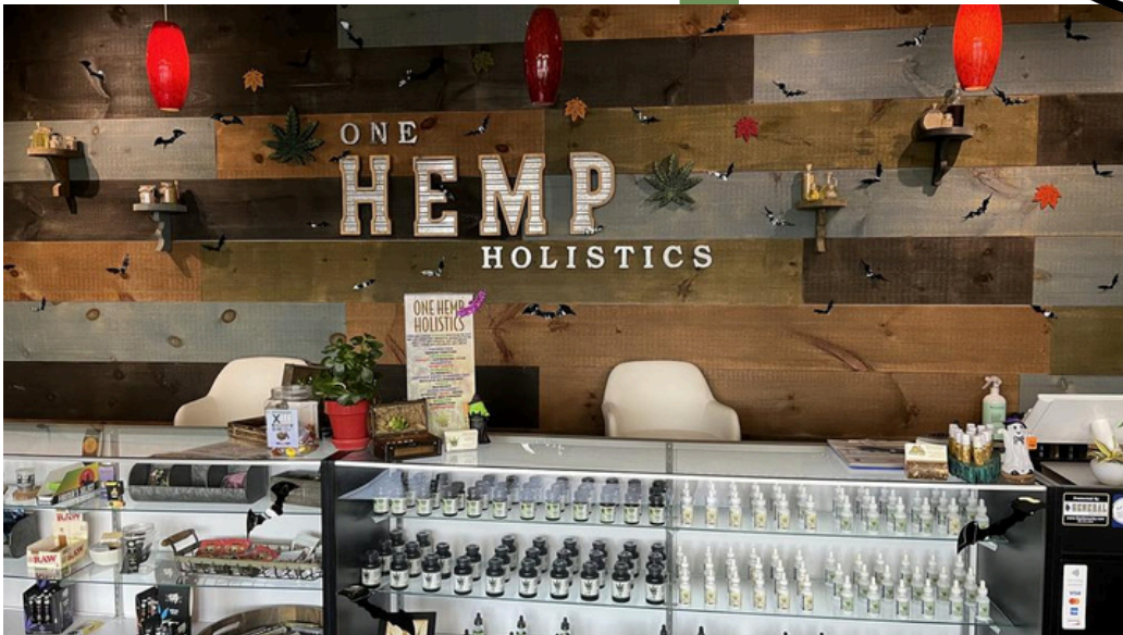
One Hemp Holistics is first of its kind in Niagara County - Buffalo Business First